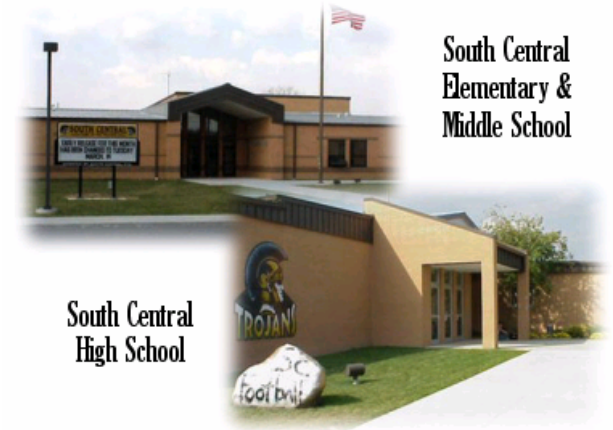
South Central Elementary & Middle School

Use the attached form to send in your donation today!